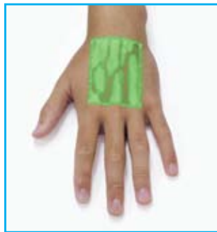
Actual VeinViewer image projected onto the surface of the skin.

The projected image reveals the vein structure not readily seen by the naked eye, making it easier for your clinician to find the optimal access location the first time. VeinViewer is a “no contact” device, providing no cross contamination potential and generates no harmful radiation. It can be used anywhere on the body, with the exception of the eyes, and is safe, whether you are 9 weeks old, 90 years old, or any age in between.